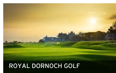
ROYAL DORNOCH GOLF