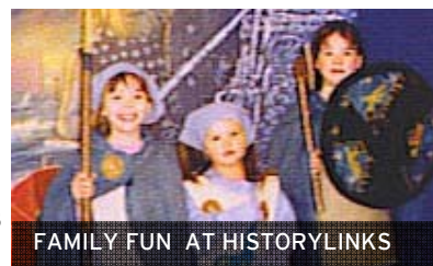
FAMILY FUN AT HISTORYLINKS

For more information: www.facebook.com/colourcraftworkshop/