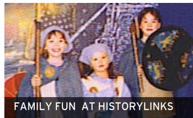
FAMILY FUN AT HISTORYLINKS

www.facebook.com/SutherlandClassicCarTour