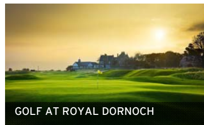
GOLF AT ROYAL DORNOCH