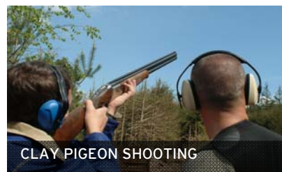
CLAY PIGEON SHOOTING