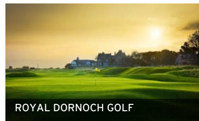
ROYAL DORNOCH GOLF

For more information: http://www.dadca.org.uk/cinema.asp