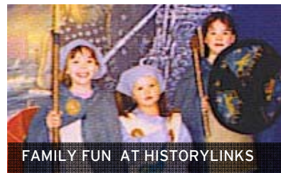
FAMILY FUN AT HISTORYLINKS

For more information: www.timespan.org.uk/programme/exhibitions/no-colour-bar-highland-remix