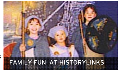
FAMILY FUN AT HISTORYLINKS

For more information: www.facebook.com/colourcraftworkshop/