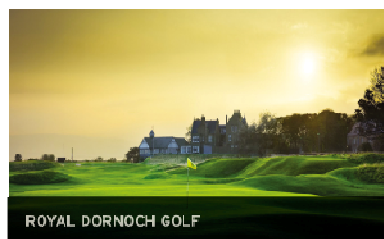
ROYAL DORNOCH GOLF