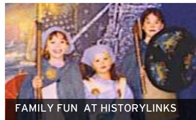
FAMILY FUN AT HISTORYLINKS

For more information: www.historylinks.org.uk or 01862 811 275