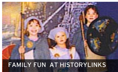
FAMILY FUN AT HISTORYLINKS

Work with our in-house jeweller to create a variety of jewellery. Separate classes for each of the above and is run on demand for a minimum of 2 people. Over 18s only. Cost: Varies depending on selection. Price reduction if 3-4 people. For more information: www.golspiegallery.co.uk/whats-on