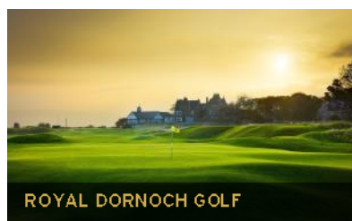
ROYAL DORNOCH GOLF