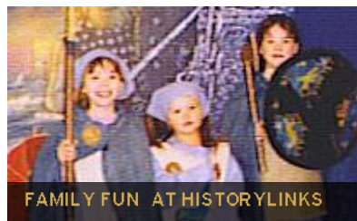
FAMILY FUN AT HISTORYLINKS

For more information: www.eventbrite.co.uk